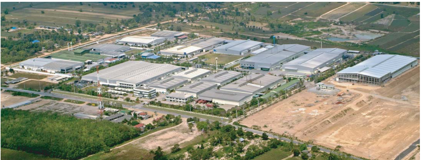
AEROFLEX INTERNATIONAL CO., LTD. HEAD OFFICE & FACTORY, RAYONG, THAILAND. (86,302 M 2 )