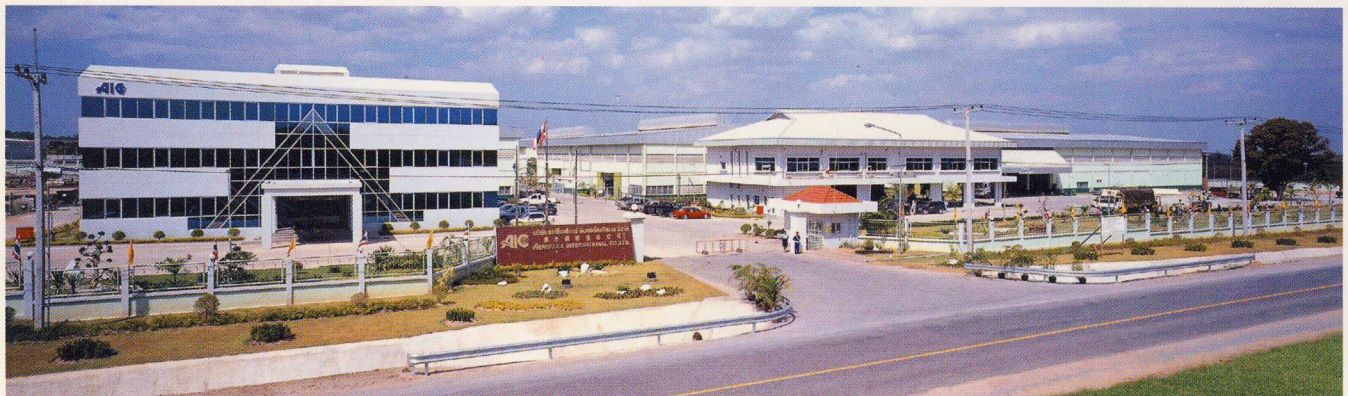
AEROFLEX INTERNATIONAL CO., LTD. HEAD OFFICE & FACTORY, RAYONG, THAILAND.