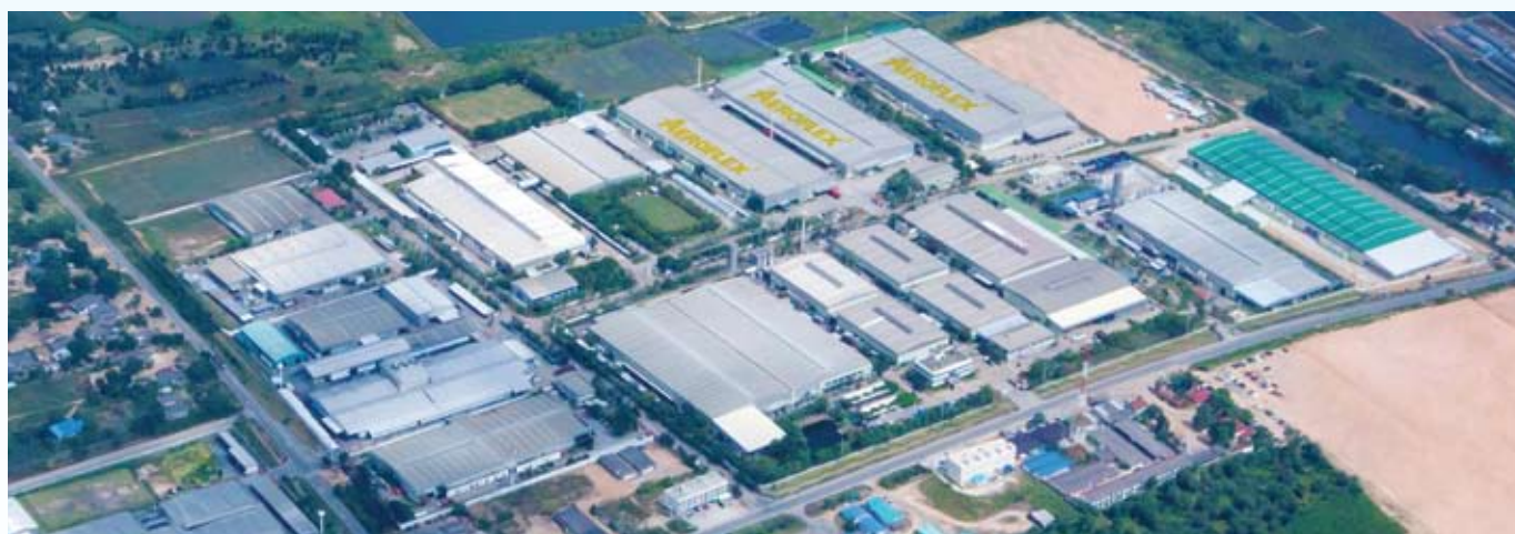
AEROFLEX CO., LTD (Total area 100,000 m 2 )