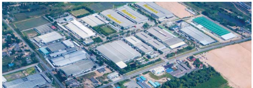
AEROFLEX CO., LTD (Total area 100,000 m 2 )